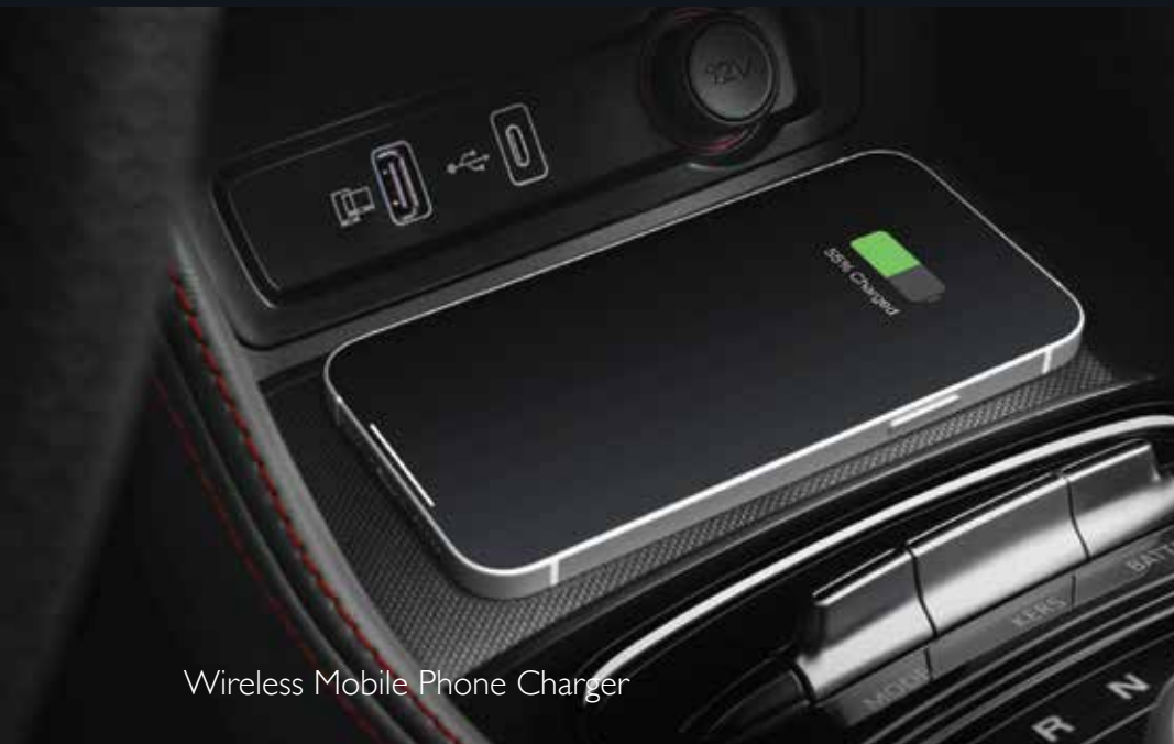
Wireless Mobile Phone Charger