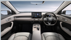
White and Beige