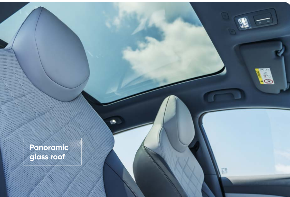
Panoramic glass roof