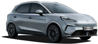
● Cosmic Silver