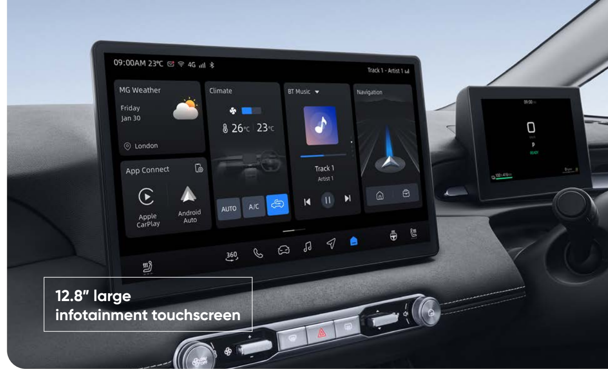
12.8" large infotainment touchscreen