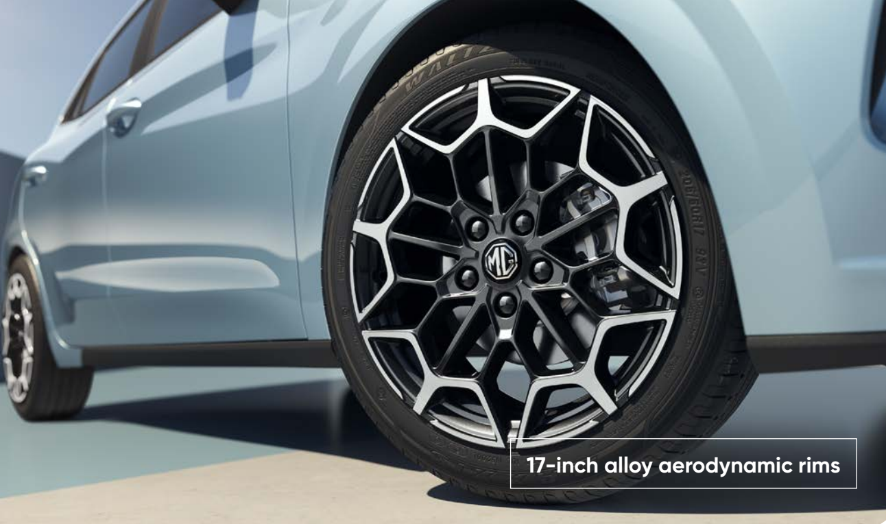
17-inch alloy aerodynamic rims