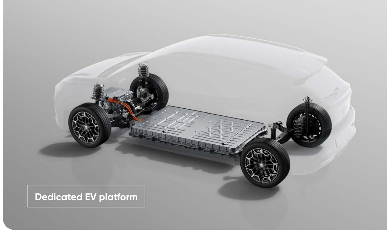
Dedicated EV platform