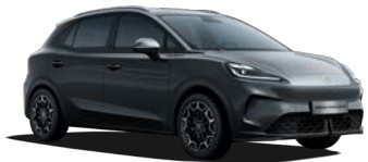
● Camden Grey