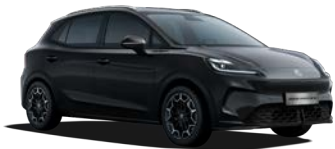
● Black Pearl