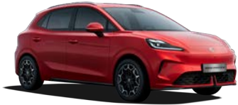
● Dynamic Red