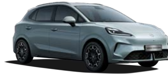
● Sage Green