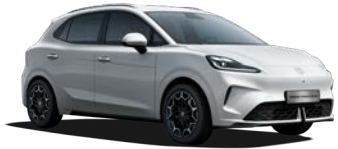
○ Arctic White