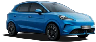
● Holborn Blue