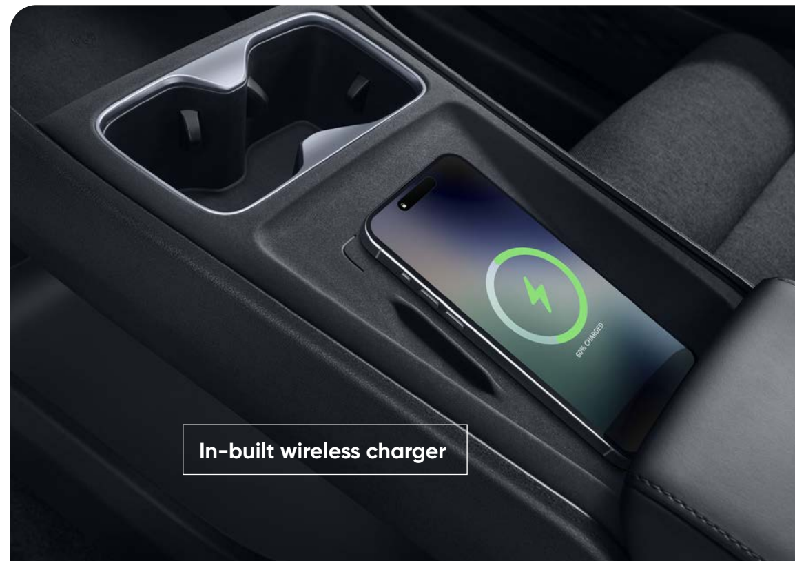
In-built wireless charger